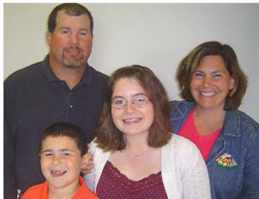
The Parsons Family

1194 Fletcher Chapel Road, Kenbridge, VA 23944, by baptism