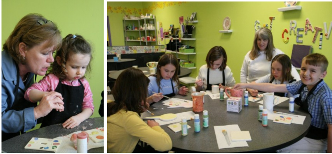
Twenty children and adults enjoyed an afternoon decorating their own "Work of Art" last Sunday!

Meet at MHBC at 7:00 AM, return by 6:30 PM Our mission site is at the Children's Home of Virginia Baptists in Ettrick